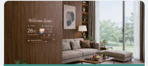
智能家居 Smart home